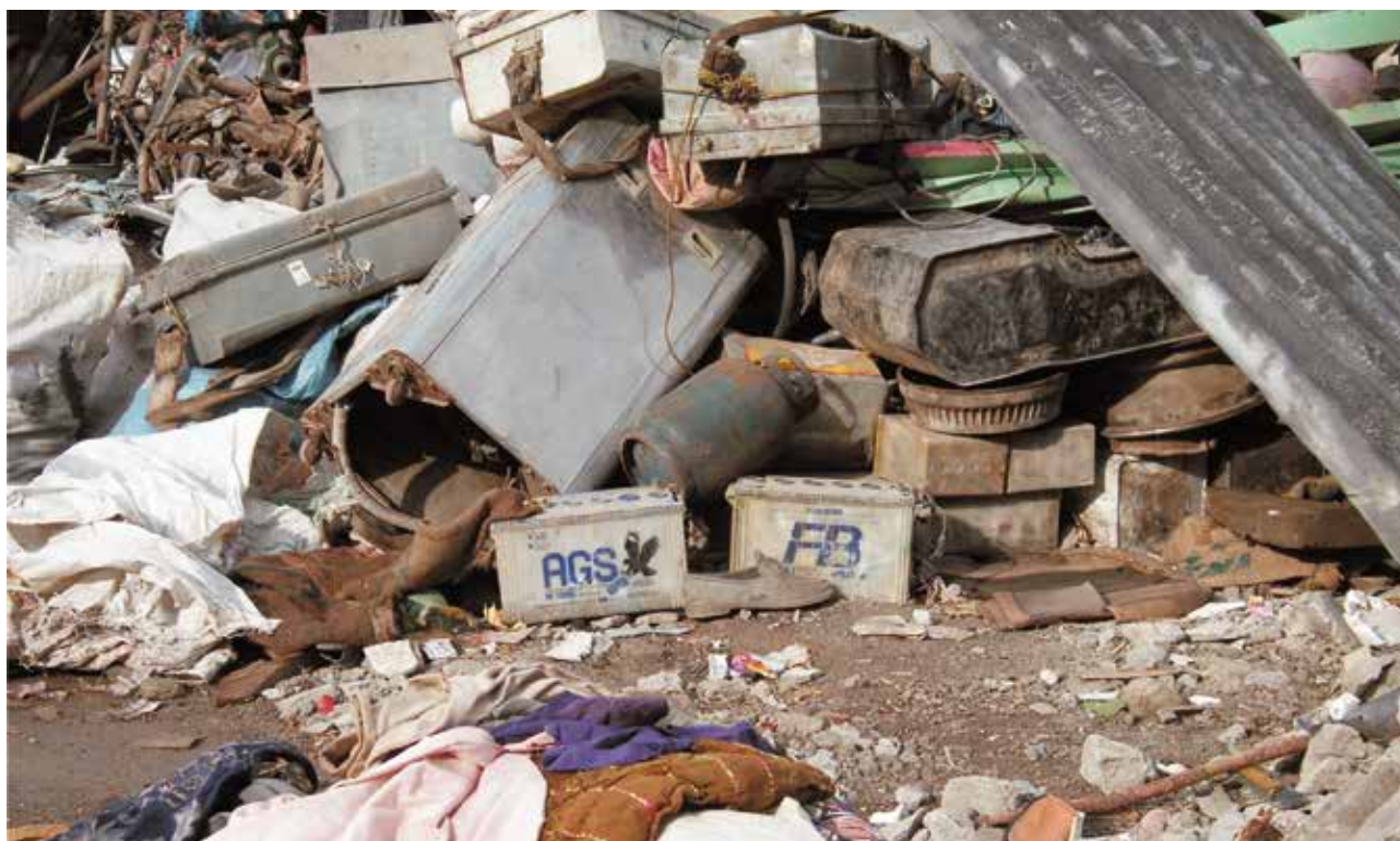
Hazardous waste (car batteries and LPG cylinder) mixed with debris, Balakot 2005.