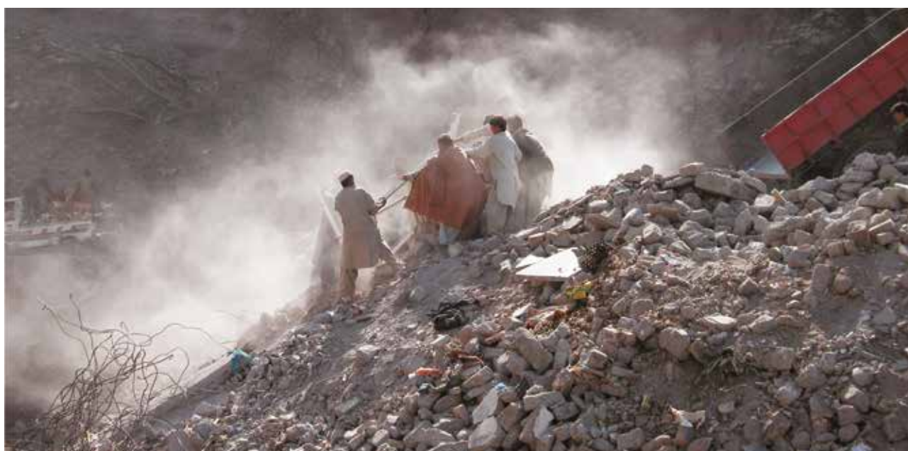
Salvaging scrap metal from post-earthquake debris, Muzaffarabad.