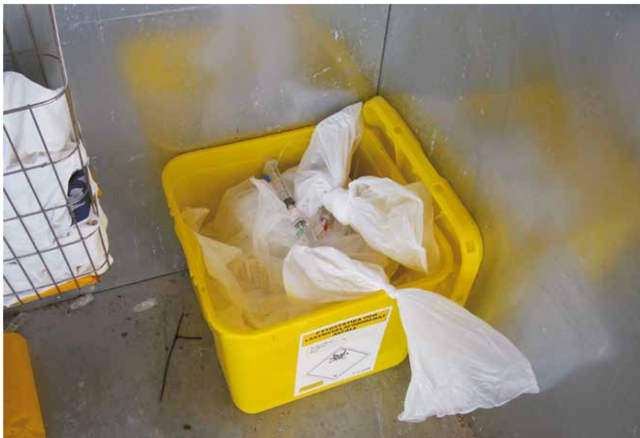
Healthcare waste is segregated and stored in clearly distinguished yellow container awaiting disposal.

Further Resources to support implementation in the field. Please contact the Environmental Emergencies Centre: www.eecentre.org and use the “contact us” button.