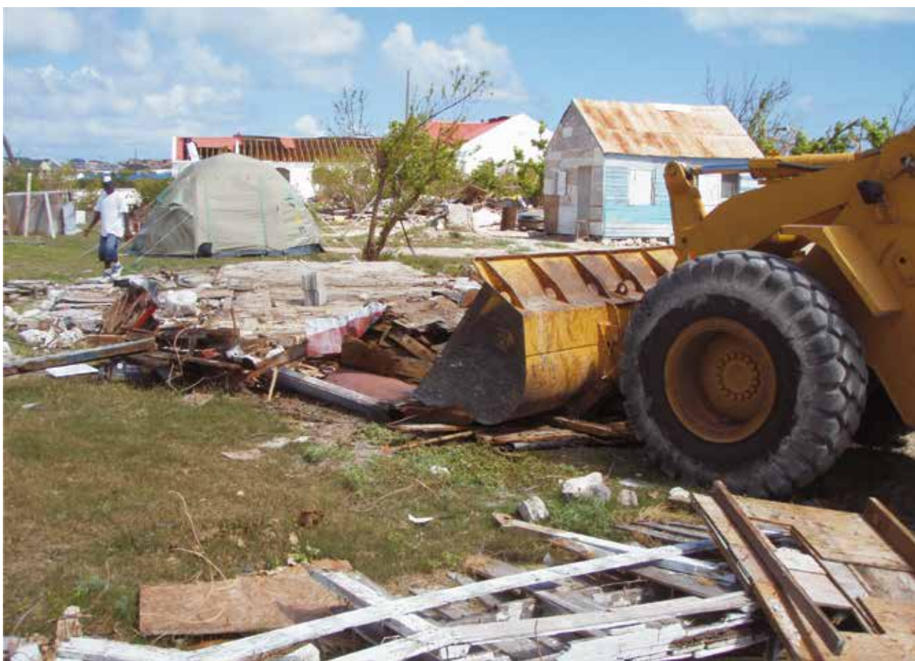
Clearing hurricane debris in post-hurricane Turks and Caicos Island 2008. Note the lack of appropriate equipment to segregate roofing and reusable boards.