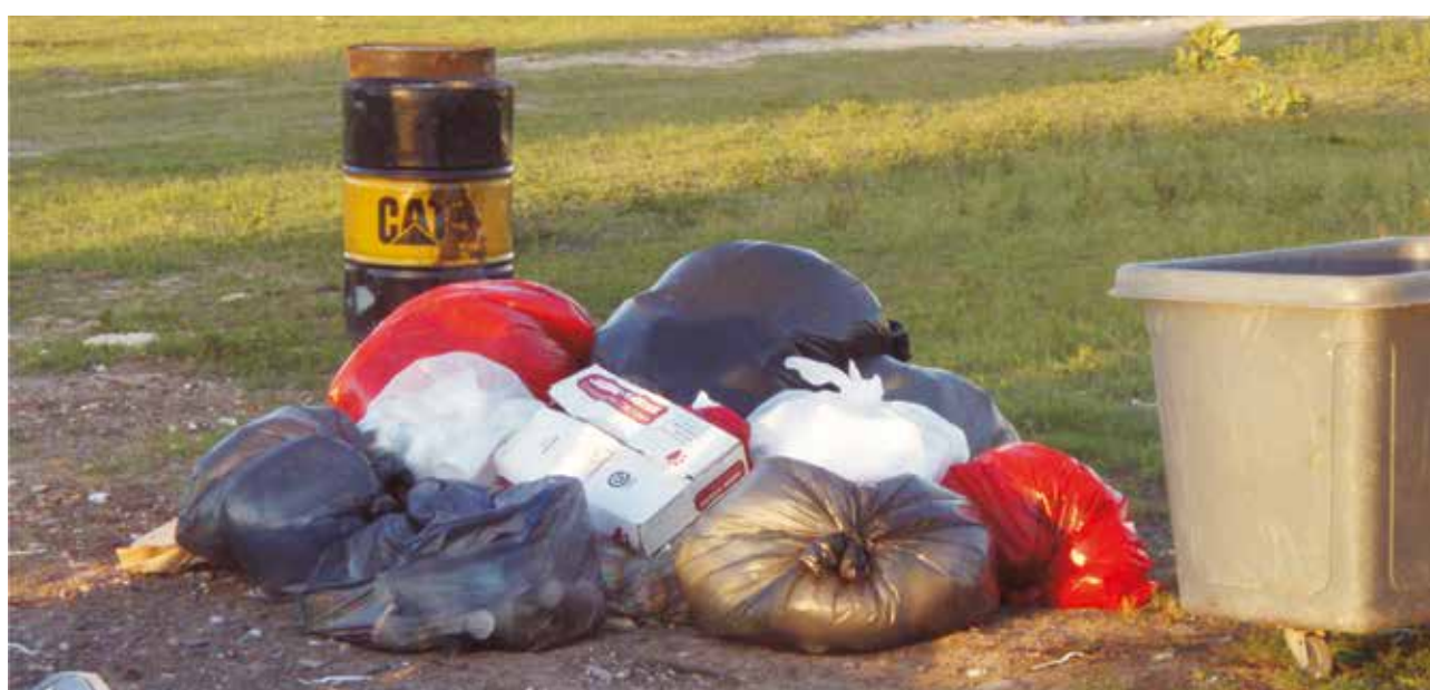
Mixed healthcare waste, including red bags indicating infectious waste, disposed of openly in post-hurricane Turks and Caicos Island 2008.