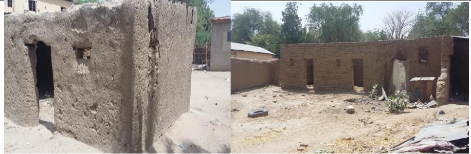
Showing typical damage situation that warrants light repair of category 3

This category reflects buildings that have incurred significant damage that affects 30 – 50% of four walls, no roof, window, doors and require flooring. However, if the damage index of a building is between 50% – 90% and require up to USD 292 to fix, it is classified under the major repair category. However, in cases where a building is not structurally stable, an alternate shelter solution should be provided (e.g. Transitional Shelter) to support vulnerable families.