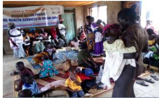
OVCI health service in Juba.

South Sudan Emergency type: Complex Emergency