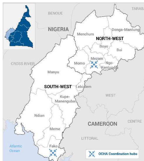
The boundaries and names shown, and the designations used on this map do not imply official endorsement or acceptance by the United Nations.