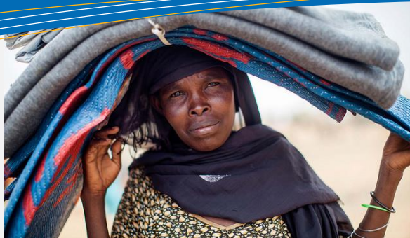
An IDP woman in Darfur receives assistance