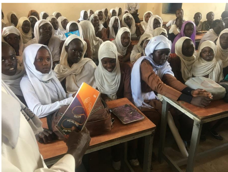
Girls in a school in Nertiti (Central Darfur) that is funded through the SHF (UN, Nov 2017)

The Sudan Humanitarian Fund (SHF) announced the strategy for its first standard allocation of funds for 2018 for the total of US$3 million. The strategy focuses on the needs of South Sudanese refugees in White Nile State ($1.5 million) and prevention of waterborne diseases in West Kordofan, Red Sea and White Nile states ($1.5 million).