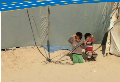
Children in a displacement camp in Anbar Governorate.