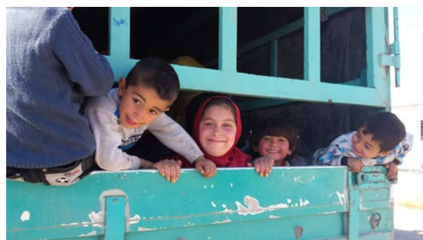
Children return to homes in east Mosul from Hasansham camp.

Trauma casualty rates have decreased in recent weeks following the lull in military operations. Trauma care capacity close to the city remains low, and many wounded civilians are still being shuttled 80 kilometres to hospitals in Erbil. Since military operations began on 17 October, over 1,600 civilians have been treated for trauma injuries in Erbil's main hospitals. An NGO-run field hospital sited 20 kilometres east of Mosul, which opened its doors on 8