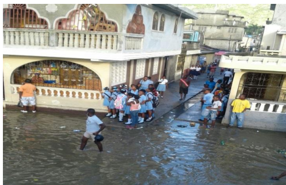
A flooded street in Cap-Haitien.

The rainy season has not started yet but several departments of the country, especially the North, Grand Anse and West, have already affected by the effects of flooding that have increased the vulnerability of thousands of families. According to a report by the Civil Protection Directorate (DPC) on March 3 rd , more than 10,000 homes were flooded in the north and west. One person was killed and another was missing in the department of Grand-Anse following heavy rains on February, 27th thru 29th.