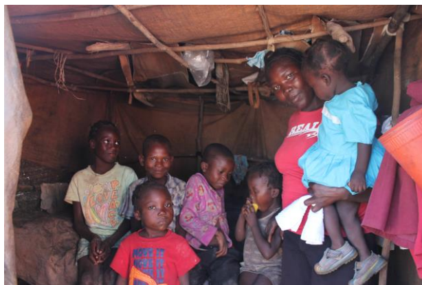
One of the families in temporary sites in Anse a Pitres.