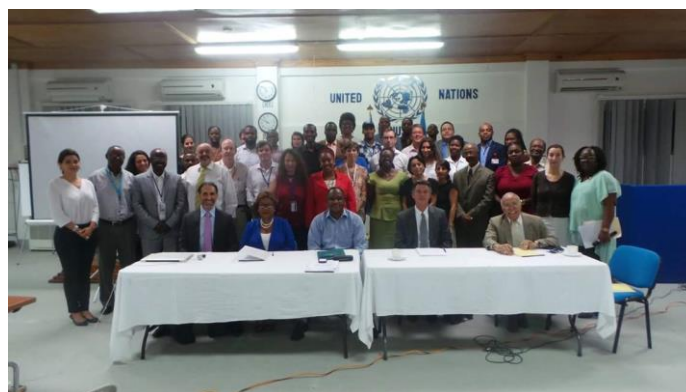
Members of the Humanitarian Country Team and government officials in Haiti during the Workshop on 24 February in Port-au-Prince.

The humanitarian community along with the Haitian government launched the Humanitarian Response Plan (HRP) process in Haiti. On February 24, a workshop aiming at consolidating the humanitarian response plans was held under the leadership of the Humanitarian Coordinator. Among the stakeholders who took part in this exercise were the Minister of Public Health (MSPP), the Minister in charge of Haitians Living Abroad (MHAVE), and the Director General of the Ministry of Planning and External Cooperation (MPCE).