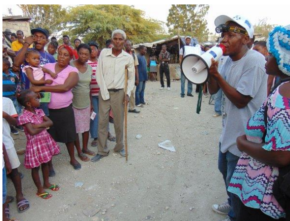
Evacuation exercise at village Gari, St. Philomène, Tabarre.

In addition to the above, the DPC is working on the update of the contingency plan with the support of the international community. Such plan aims at coordinating preparedness and response activities to natural disasters in 2016. National and international actors also remain vigilant and prepared to sustain and support the efforts of the Government.