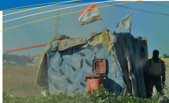
PMF Outpost Salah Al-Din