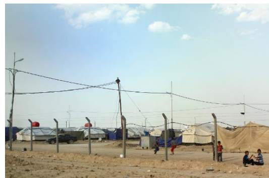
AAF Camp

Since the conclusion of the major military operations in 2017, IDPs from Al-Qa'im sub-district have returned home at a rate lower than 50 per cent, which they attribute to destruction of homes and lack of livelihoods. Reportedly, IDPs from Al-Qa'im were told during June and July that if they did not return, it would result in security actors perceiving them as ISIL-affiliated, leading to concerns of negative reactions from neighbours in their areas of origin. Some of those who managed to return were displaced again due to lack of adequate shelter in Al-Qa'im. Some of these families have become secondarily displaced in Fallujah in unsuitable accommodation.