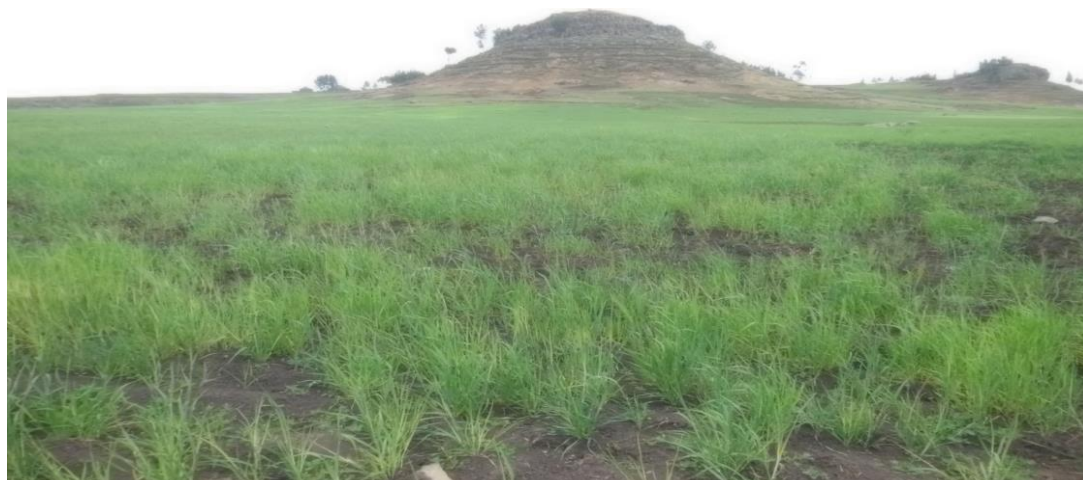
Figure 2 Poorly performed barley harvest as a result of late planting and moisture stress in Tsehay Mewucha kebele, Delanta woreda .

For spring/ belg -benefiting highlanders in Amhara region, food security depends on the performance of the seasonal belg rains. The preliminary report of the 2018 Food Security and Agriculture Assessment revealed that the performance of the belg (February to May) rains was normal to below normal in most belg -producing areas of Amhara region. This has led to harvest loss and to the deterioration of livestock body conditions (leading to reduction of income from livestock sell and livestock product), particularly in Delanta (South Wollo zone), Angot, Gazo Belay and Wadla (North Wollo zone) woredas where complete loss of belg harvest and livestock were reported. The food and nutritional status of the population in these areas is critically poor, necessitating urgent support.