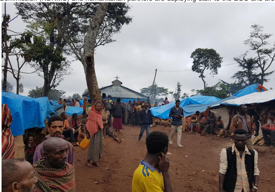
Figure 1 IDPs sheltered in a church in Kercha town, West Guji.

In response to the growing humanitarian needs of the people displaced by inter-communal violence in Gedeo and West Guji zones, the Government and partners have established Emergency Operation Centers in Dilla town of SNNP region and Bulle Hora town of Oromia region. The operational hubs will enable Government and partners to provide a coordinated and prioritized life-saving food and non-food assistance to nearly one million people displaced across Gedeo zone and West Guji zone. The National Disaster Risk Management Commission (NDRMC) and humanitarian partners are deploying staff to the EOC and are