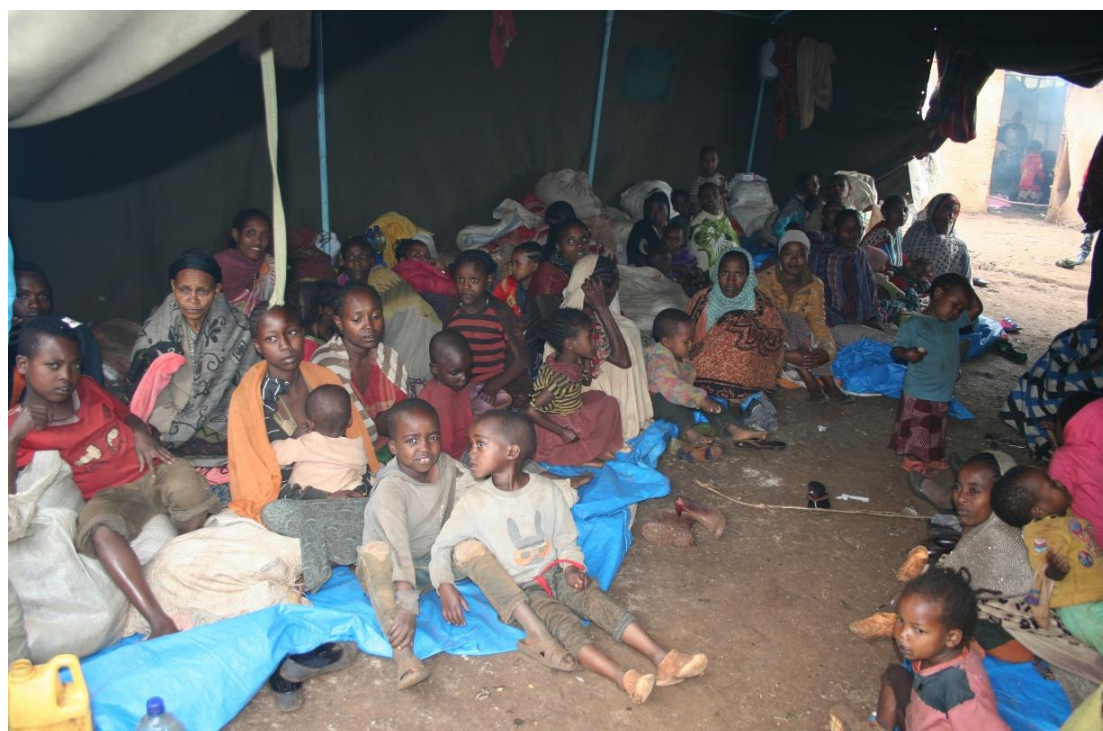
Figure 1 IDPs at TVT site of Gedeb woreda want to return home soon if peace and security is guaranteed.

Requirement for the Gedeo-West Guji conflict IDPs assistance for six months.