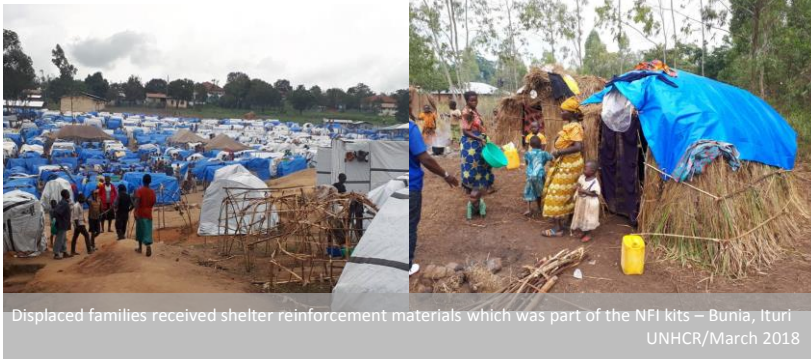
Displaced families received shelter reinforcement materials which was part of the NFI kits – Bunia, Ituri UNHCR/March 2018