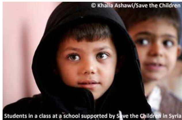
Students in a class at a school supported by Save the Children in Syria

Education was hit hard by the war in Syria. Before the crisis, Syria had a strong education system with almost universal primary school enrolment and 70% of children attending secondary school iv . However the worsening crisis is placing an entire generation of children at risk of being lost to a cycle of violence. Estimates indicate that 2.1 to 2.4 million children are currently out of school in Syria, approximately half of the 4.3 million children (5-17 years old) eligible for primary and secondary education in the current school year, and another million of those in school are at risk of dropping out v . In 2014, Syria had the second worst enrolment rate in the world vi . The lack of safe and protective learning spaces, coupled with a shortage of teachers, textbooks, as well as adequate water, sanitation and hygiene facilities, have all become obstacles to children's access to an education.