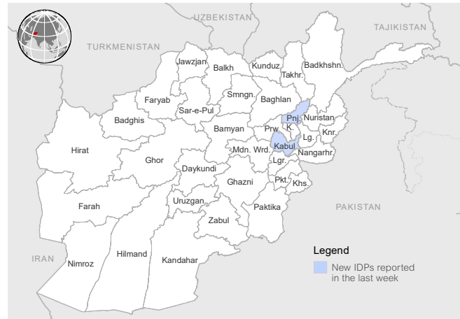
Provinces with conflict displacement in the past week, according to initial reports.

According to IOM, a total of 11,141 undocumented Afghans spontaneously returned or were deported from Iran through the Milak (Nimroz) and Herat (Islam Qala) border crossings between 16 - 22 Dec 2018, 2 per cent