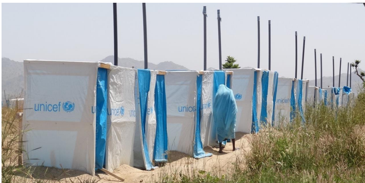
One section of the 60 latrines and 30 showers constructed for the refugees at Minawao camp in Mayo Tsanga Division (Mokolo)