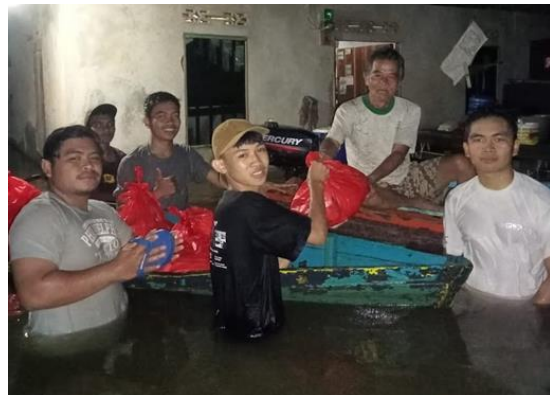
The Catholics Youth assisted by residents distribute aid in Tanjung Simba and Ella Pinoh

Situation of Affected Locations - Caritas Diocese of Sintang