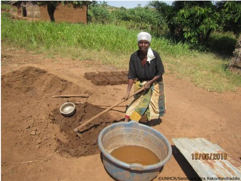
Tanganika Shelters destroyed distribution by Aire de Santé