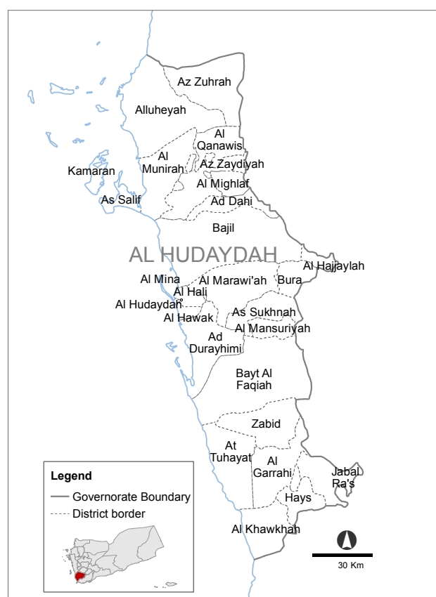
Al Hudaydah governorate

As far as the situation in Taizz Governorate is concerned, armed clashes have reportedly intensified in the eastern parts of Taizz City and in the western front in Maqbanah and Al-Ma'afir Districts. The Ibb Health Sub-Cluster is supporting three frontline hospitals (Al-Barh and Hajdah Hospitals in Maqbanah District and Aoon Hospital in Sharaab Al-Salam District) with medical supplies to prepare for the possible casualties from areas affected by violence. The shift in frontlines in western Taizz has, however, opened humanitarian access to Al Wazi'iah and Mawza Districts from the cities of Al Turba and Aden.