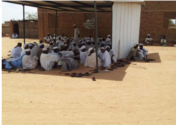
IDPs from En Address village sheltering under small bush (left) and inside mosque (left) in Dar El Naeem quarter of Mellit town (Photo by SAG, 14 July 2015)

Location map indicating IDPs movement from their original villages towards Mellit town: